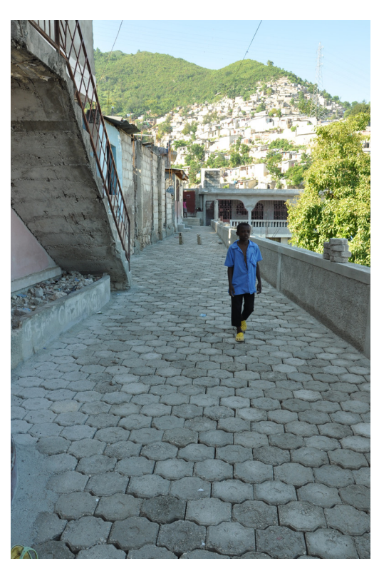
These photos illustrate two different ways in which UNDP's debris management work is benefiting the rehabilitation of the Carrefour Feuilles neighborhood in Haiti's capital, Port-au-Prince. The left-hand photo shows an alley cleared of debris. The right-hand photo shows the rehabilitation of the same alley through the return of the same debris after being recycled into 'adoquins' (interlocks).

This section focuses on a number of key issues to take into account when developing a project document for debris management. The related stages of the UNDP project management cycle, as detailed in the UNDP Programme and Operations Policies and Procedures (POPP) are the 'Justifying a project' and 'Defining a project' stages. The main sub-sections fall under the familiar titles of: 1) Situation Analysis (including Needs Assessment); 2) Programme Strategy; 3) Results Framework; 4) Risk Assessment; 5) Management Arrangements; 6) Operational Support; 7) Partnerships; 8) Monitoring and Evaluation; 9) Resource Mobilization; and 10) Communications Strategy. A quick checklist for the planning phase concludes the section.