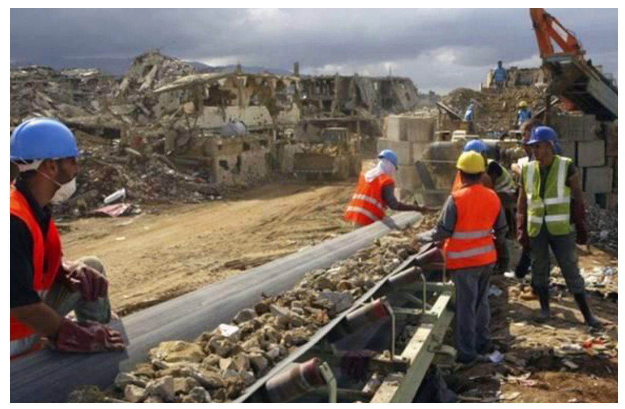
UNDP's multiple debris management initiatives in Lebanon have all centered on the principle of community ownership and engagement. As part of the Nahr-El-Bared Camp (NBC) project, shown here, community members shown are engaged in the process of sorting and crushing some 500,000 cubic meters of debris, for further treatment and reuse.