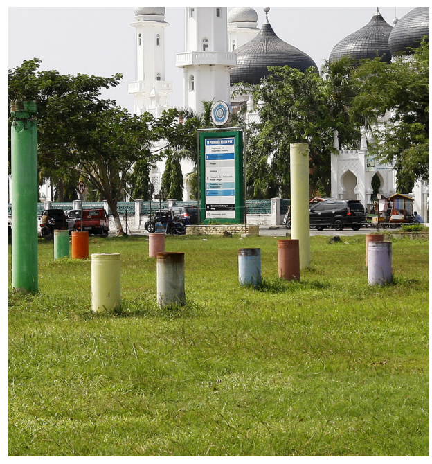
Masjid Raya, the Grand Mosque, pictured in these photos, is an iconic symbol of Banda Aceh as well as the entire province. During the tsunami, the mosque served as a refuge for many residents fleeing the rushing waters, but Taman Sari, the adjacent park shown in the foreground, was buried under thousands of tonnes of curled metal, vehicles, shattered glass, wood and bodies. Through UNDP's Tsunami Recovery Waste Management Programme, all the debris in the park was cleared and reused to help rebuild Aceh within a matter of months. The programme has now cleared over 1,300,000 cubic metres of debris in Banda Aceh and other affected areas, including Meulaboh, Calang and Bireuen.

Based on UNDP's experience in a large number of post conflict/post disaster recovery situations, the following key lessons should be taken into account before engaging in any debris management project: