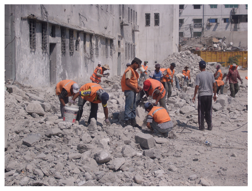
UNDP/PAPP and its partners ensured that sorting of debris was performed on-site through labour-intensive methods before it was sent on to crushing or dumping sites, which gave local home owners the opportunity to reclaim personal belongings and recyclable materials. Of 480,000 tons of debris removed through the project, the majority was crushed and eventually reused in road rehabilitation initiatives by UNDP, NGOs, and local institutions.

At this stage is also important to differentiate between debris/rubble removal and debris management: debris removal is an immediate after-crisis humanitarian activity while debris management is a medium to long-term activity focused on development (skills building, planning, legal aspects, capacity building, etc.). Therefore, the guidance note uses the term debris management, which includes debris removal in its definition.