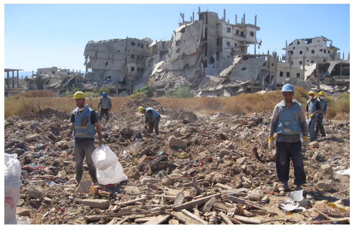
The Nahr El Bared Palestinian Camp project was UNDP's largest-ever debris management intervention in Lebanon, with a project budget of 15 million USD.

This section looks at the implementation challenges that will need to be addressed if UNDP is to turn the objectives outlined in the previous two sections into practical actions as quickly as possible. Project implementation is framed within three main phases over a period of up to two years.